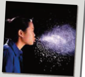
Photo Plasma - Most effectively reduce bacteria, viruses, mold and VOC. Also, remove airborne VOC and unpleasant odor.

H1N1 is a type of virus with hyper-infection. It can be transmitted by an infected person to more than ten people, within 3 to 6 feet when he/she is coughing or sneezing.